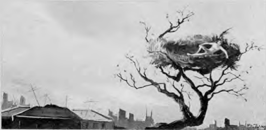
OIL 5 x 7 "AWAY FROM IT ALL"